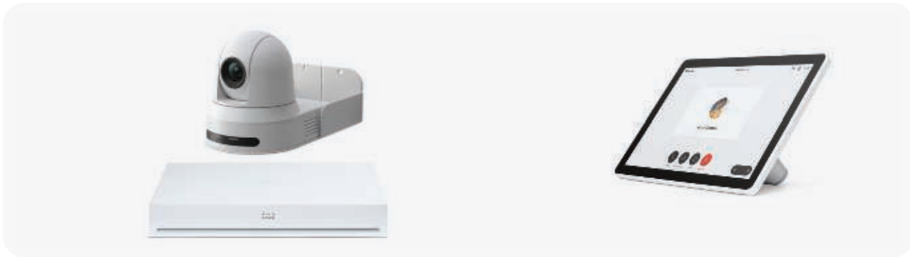
Figure 2. Webex Room Kit Pro PTZ 4K integrator package with Webex Codec Pro, the Webex PTZ 4K Camera, and Webex Room Navigator

The Room Kit Pro PTZ 4K bundle is rich in functionality and experience, and is priced and designed to be easily scalable to all of your collaboration spaces—whether registered on the premises or to the Webex cloud service. Figure 2 shows the default components of the package.