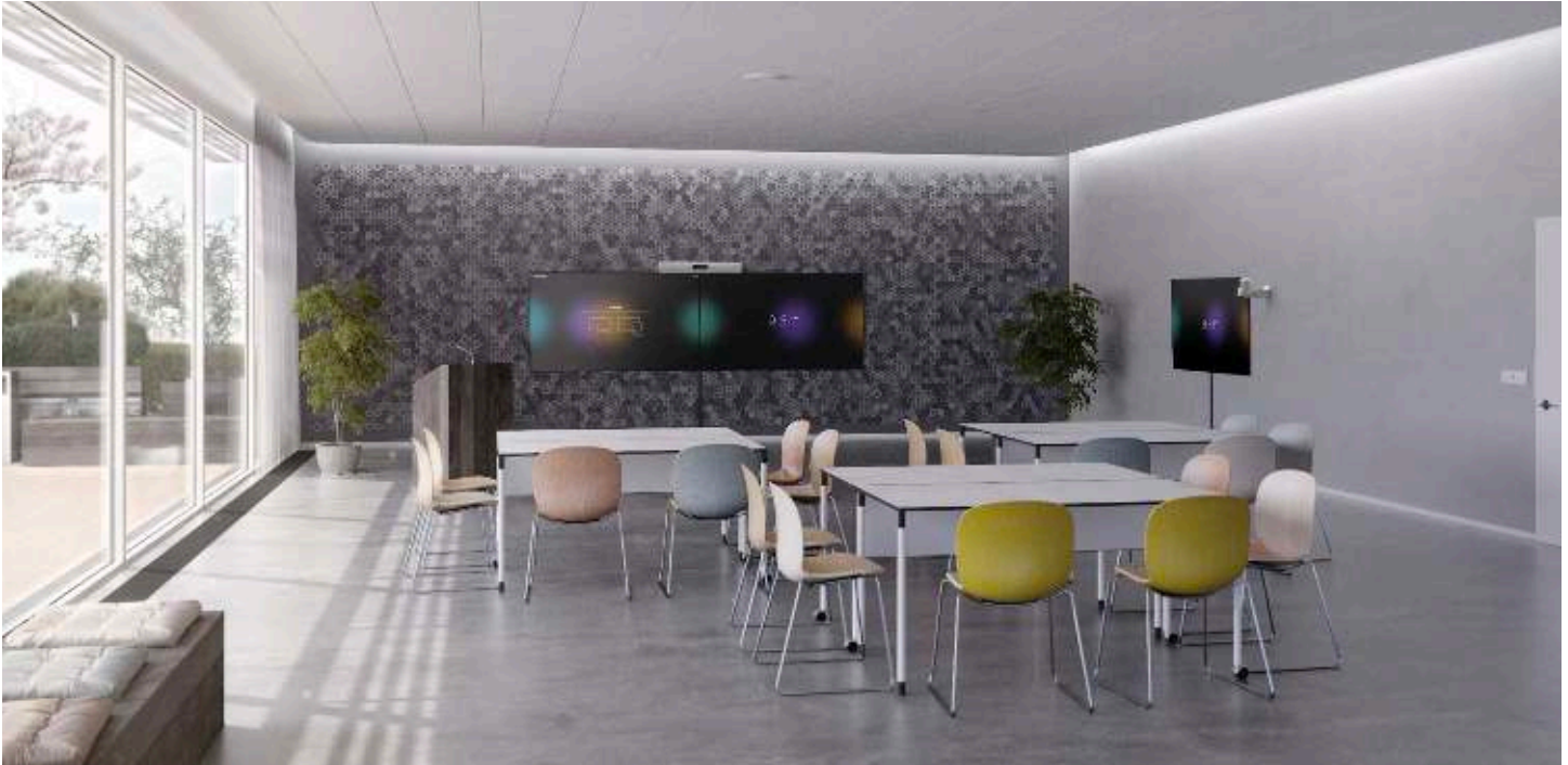
Figure 1. Webex Room Kit Pro PTZ 4K bundle with an additional Webex Quad Camera unit deployed in a custom briefing room

The Webex® Room Kit Pro PTZ 4K Integrator Bundle is a powerful collaboration solution that integrates with up to three flat-panel displays to bring more intelligence and versatility to your collaboration spaces. Ideal locations for this solution include large, custom video rooms, boardrooms, auditoriums, classroom theaters, conference rooms, purpose-built workspaces for vertical applications, and more. The integrator bundle combines the performance of the Webex Codec Pro collaboration engine, the flexibility of the Webex PTZ 4K pan-tilt-zoom camera and the purpose-built Webex Room Navigator table stand control panel to offer maximum flexibility and premium video collaboration in scenarios where you need special camera placement, want to view objects close up, or want to view a wide area with pan-tilt-zoom capability.