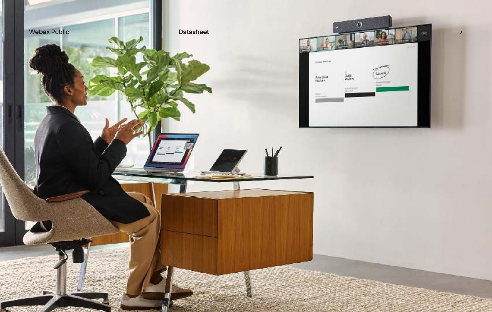
Figure 4. Webex Room Bar used for video conferencing and wireless content sharing in a dedicated office