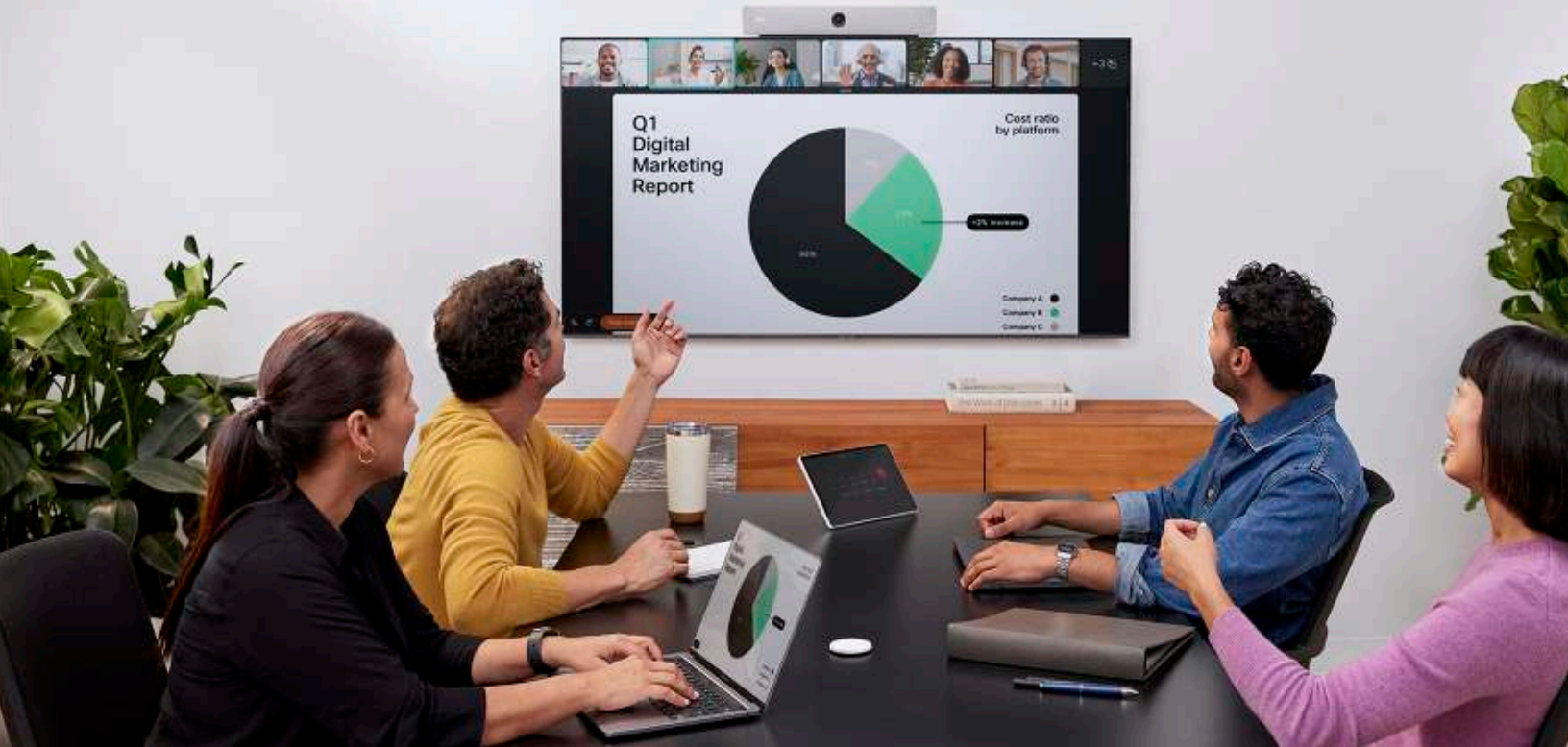
Figure 3. Webex Room Bar used for video conferencing in a small conference room