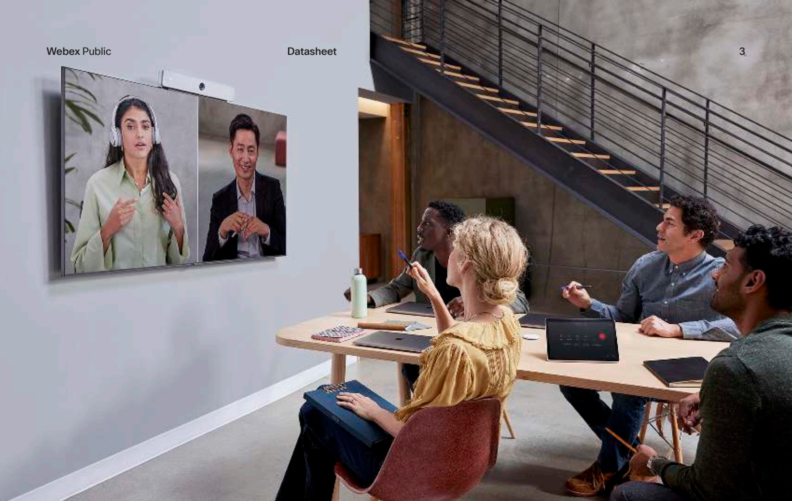
Figure 1. Webex Room Bar paired with dual flat screen displays for video conferencing in an open huddle space

Webex® Room Bar powers your best video meetings ever, in a bar. It is a compact yet powerful video collaboration device providing stunning video conferencing, boundless flexibility, and inclusive meeting experiences in your focus rooms, huddle spaces, and small meeting rooms.