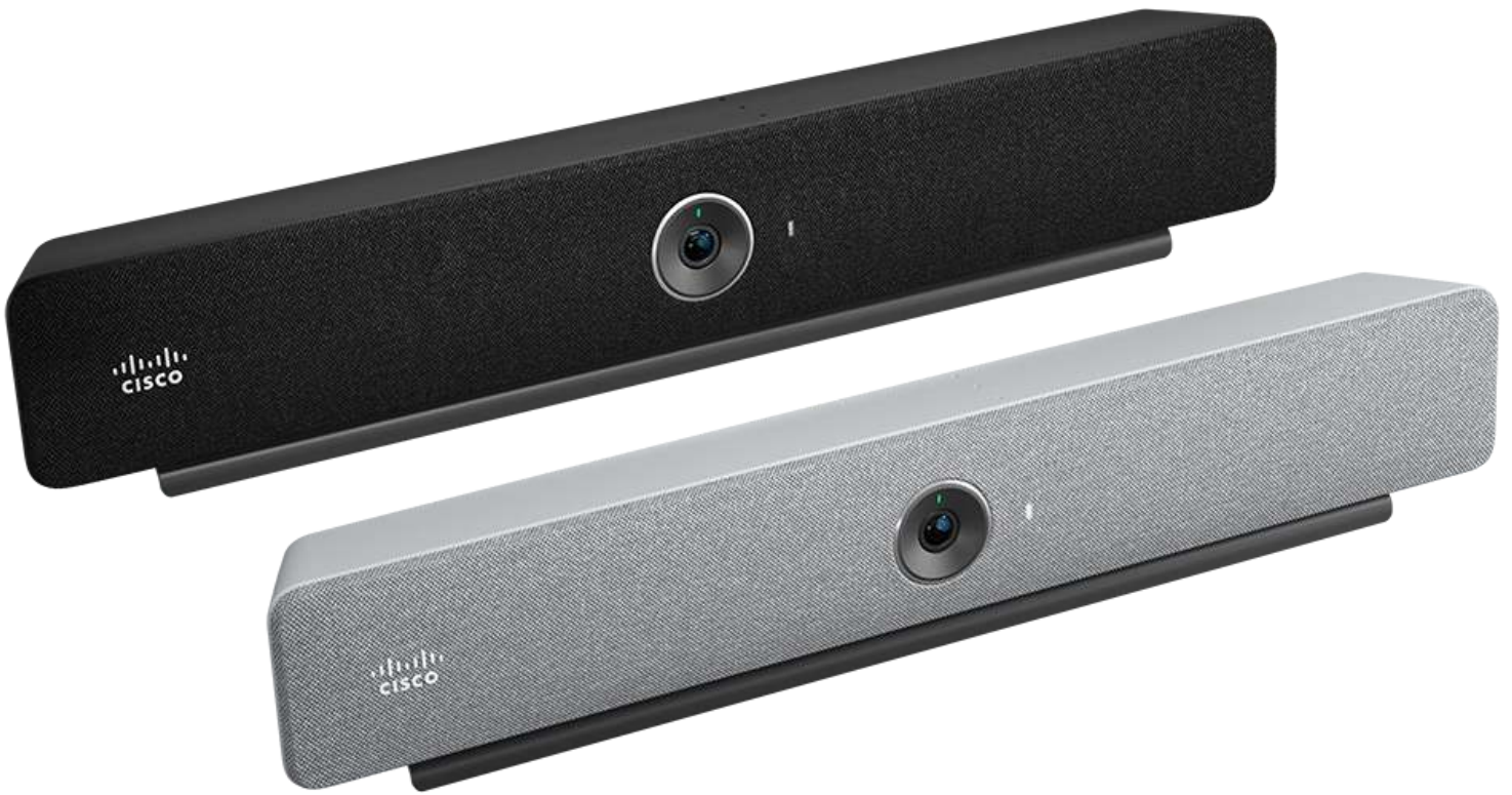
Figure 5. The Webex Room Bar main unit in First Light Gray and Carbon Black color options.