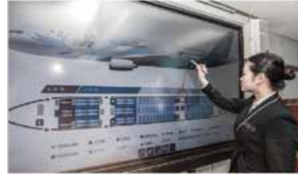
China Southern Airlines