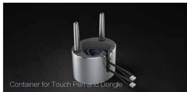
Container for Touch Pen and Dongle