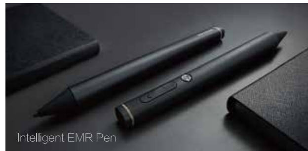
Intelligent EMR Pen