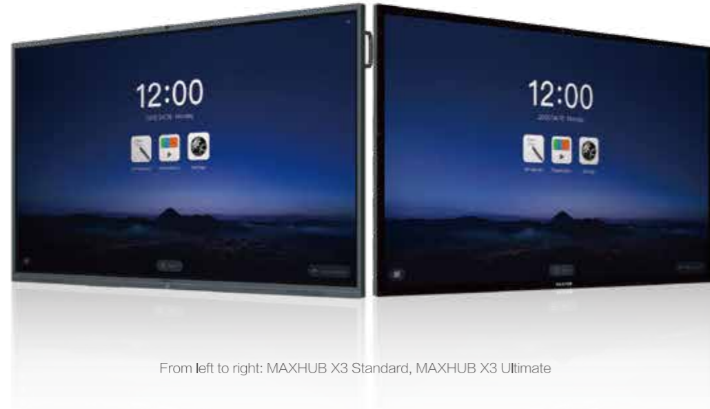
From left to right: MAXHUB X3 Standard, MAXHUB X3 Ultimate