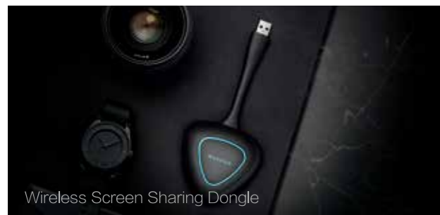
Wireless Screen Sharing Dongle