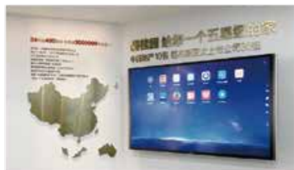
Country Garden Group