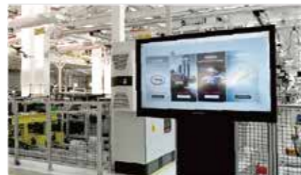
Guangzhou Automobile Group