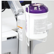
SV SANI-WIPES HOLDER