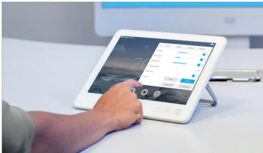
Figure 2. User interface displaying in-room control information

Cisco Touch 10 control unit enhances the ease of connection and communication by providing instant access to meeting, contacts, directories, and content. Touch 10 combines beautiful design and effortless user interaction with a consistent experience throughout the Cisco room-based video conferencing device portfolio.