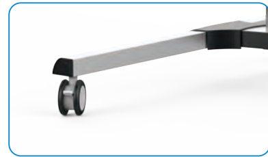
Easy Movable Castor Feet